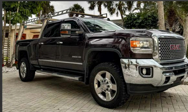
2016 Chevy Duramax – 246,000 mi