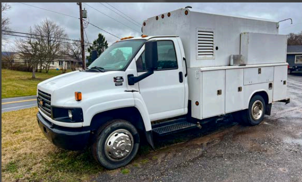
2007 Duramax 96,000 mi