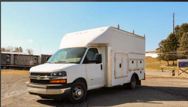
2019 Chevy – 53,000 mi