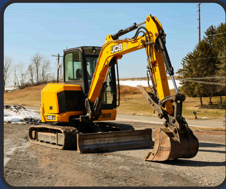
2018 JCB Excavator — 835 hrs