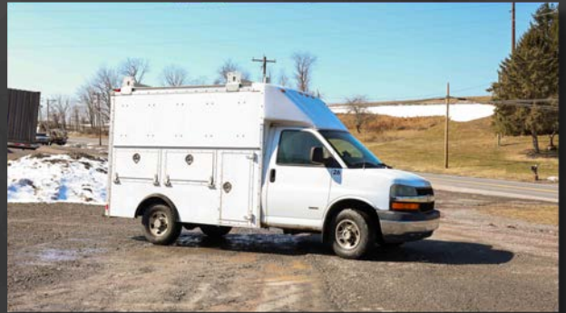
#26 – 2005 Chevy Duramax – 185,000 mi