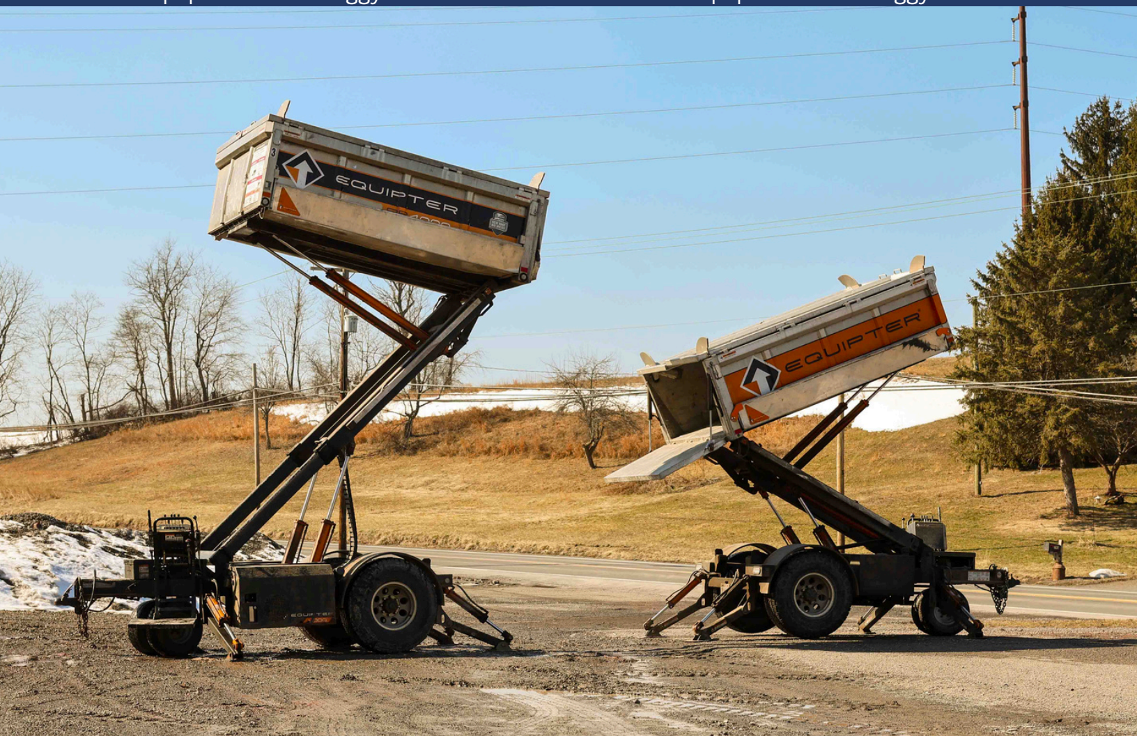
2018 Equipter Roofer Buggy — 127 hrs