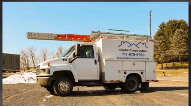
2006 Chevy C4500 – 181,000 mi