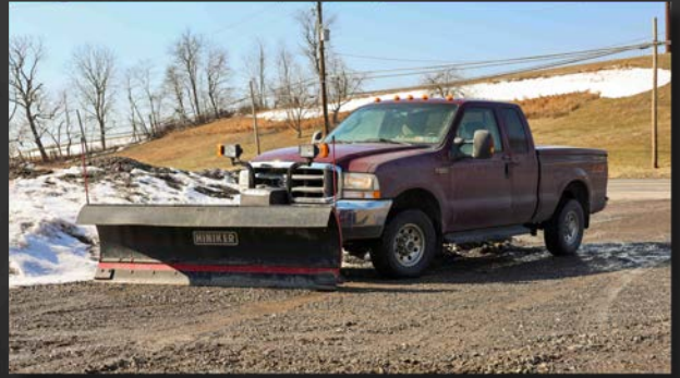
2003 Ford F-250 – 128,000 mi – Includes plow.