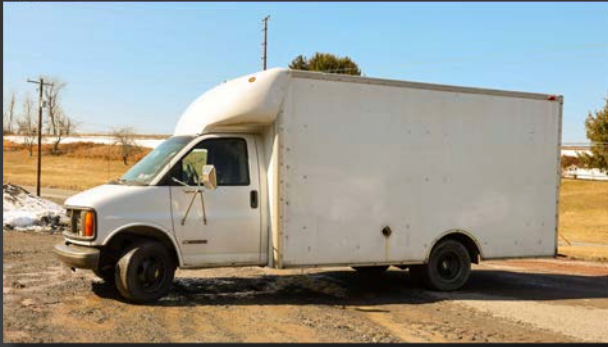
2002 Chevy – 127,000 mi