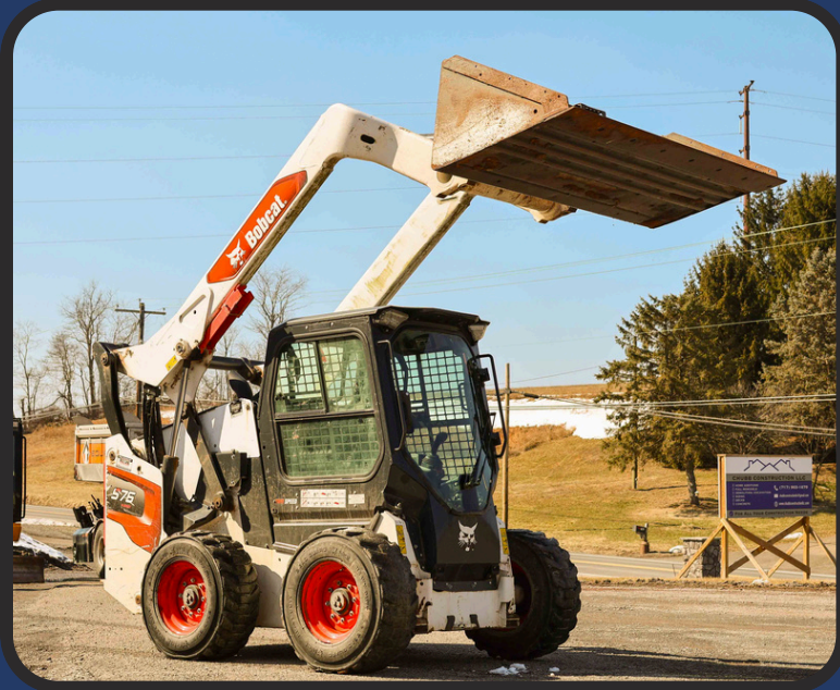
Bobcat 576 R-Series Skid Steer — 605 hrs